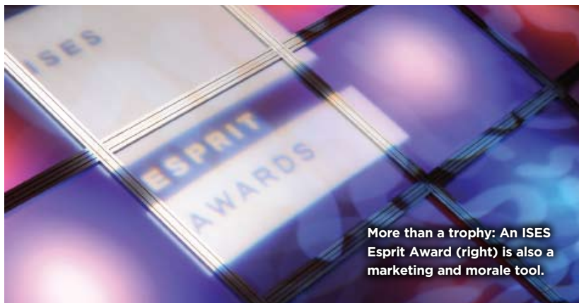
More than a trophy: An ISES Esprit Award (right) is also a marketing and morale tool.